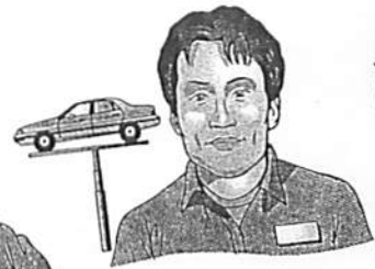
el mecánico la mecánica mechanic