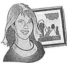
el artista la artista artist