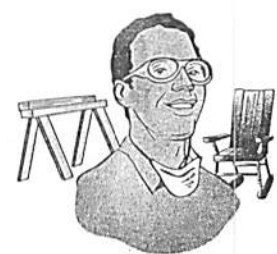
el carpintero la carpintera carpenter