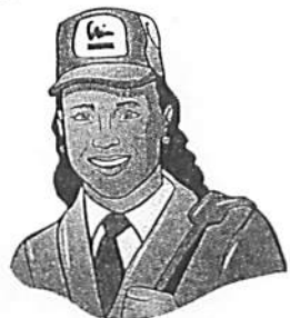
el cartero la cartera letter carrier