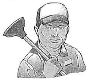
el plomero la plomera plumber