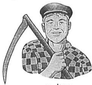
el agricultor la agricultora farmer