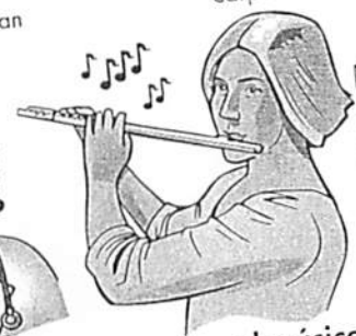
el músico la música musician