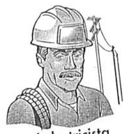
el electricista la electricista electrician