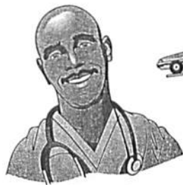
el enfermero la enfermera nurse