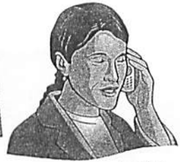
el comerciante la comerciante businessman, businesswoman