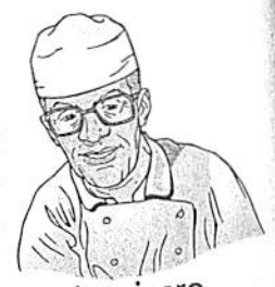
el cocinero la cocinera cook