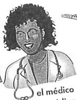
el médico la médica physician