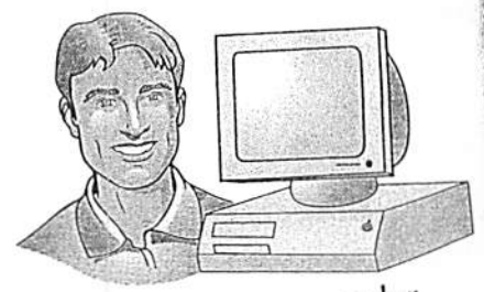
el programador la programadora computer programmer